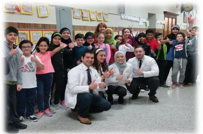
AAPA members educating kids about Antibiotic resistance at McCollough Younis Elementary School in Dearborn Student pharmacists from left to right:

AAPA-WSU also continues to host its annual "Culture and Medicine" seminar, where diverse health care providers share their experiences with cultural adversities and how to overcome them. This seminar, in addition to other networking opportunities that are hosted, provide student pharmacists with the ability to develop relationships, network, and learn from active and experienced leaders in our society.