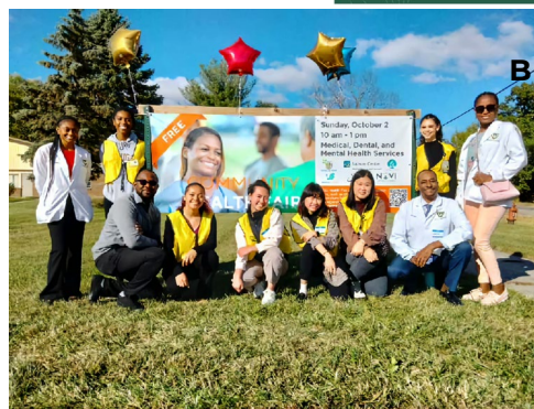
A: Vista Maria Presentation on Mental Health B: Community Health Fair, joint initiative with SNPhA, Wayne State University, and University of Michigan