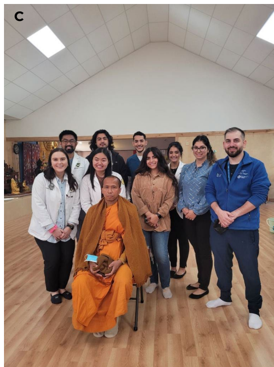
A, B: Pronoun pins fundraiser C. Midwest Buddhist Temple health fair